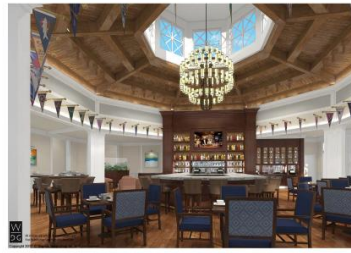
20/20 PELICAN ISLE YACHT CLUB 26° 17.5' N / 81° 49.3' W Celebrating 20 years & building for the future! View of Bar with Front Entry in Background