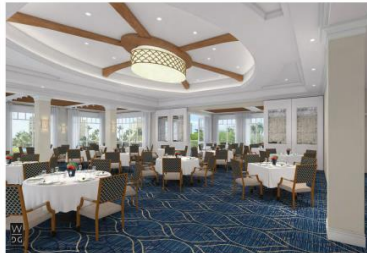
20/20 PELICAN ISLE YACHT CLUB 26° 17.5' N / 81° 49.3' W Celebrating 20 years & building for the future! Main Dining Room Viewed from the Podium